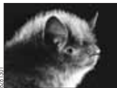
Little brown myotis, Myotis lucifugus

Primarily in forests of southwestern Canada and the western United States. Often lives alone or in small groups; females form small maternity colonies in summer. Roosts in hollow trees, under bark, in cliff crevices, caves, mines and abandoned buildings. Confirmed bat house user in Washington. Winter habitat unknown.