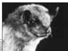
Big brown bat, Eptesicus fuscus

Western and southwestern United States and extreme south-central British Columbia, mostly in arid areas. Found in rock crevices, buildings, under bridges and in bat houses. Winter habitat unknown, presumed to hibernate locally in deep rock crevices.