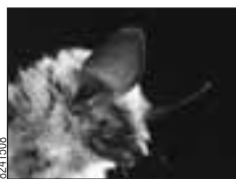
Long-eared myotis, Myotis evotis

Mostly restricted to Gulf Coast states. Rears young in caves, tree hollows and buildings. Often nonmigratory, hibernates in caves in its northern range and sometimes in tree hollows or buildings farther south. Confirmed bat house user in Florida and Georgia; believed to use bat houses in other Gulf states.