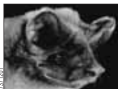
Florida bonneted bat, Eumops floridanus

Most of the United States and Canada, except for extreme southern Florida and south and central Texas. Rears young in tree hollows, buildings and bat houses. Hibernates in caves, abandoned mines and buildings. Frequent bat house users, they have overwintered in bat houses from Texas to New York.