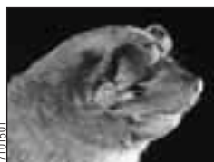
Pallas's mastiff bat, Molossus molossus

Southern Florida only. Extremely rare, seen only a handful of times since the 1960s. Uses buildings with Spanish tile roofs, as well as palm fronds and woodpecker holes. A maternity colony with 11 individuals was confirmed using a bat house with a 1½-inch chamber in southwest Florida.