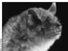
Southeastern myotis, Myotis austroriparius

In the United States, found in buildings in the Florida Keys only. Throughout the Caribbean, northern Mexico, Central America and northern South America, its roosts include hollow trees, palm fronds, rock crevices, caves, bridges, culverts and buildings. Uses bat houses year-round in Cayman Islands and Puerto Rico.