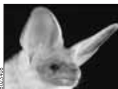
Pallid bat, Antrozous pallidus

tailed and evening bats are most common. Almost any bat that will roost in buildings or under bridges is a candidate for a bat house. These species have been documented as bat house users: